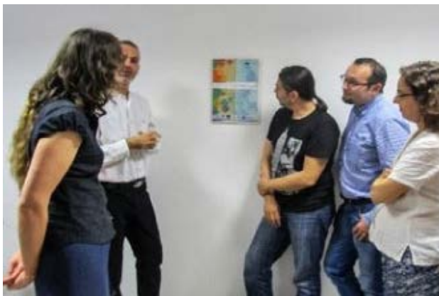
Presentation of LIGHTHOUSE project to stakeholders and partners of other EU projects by IASIS in Greece.