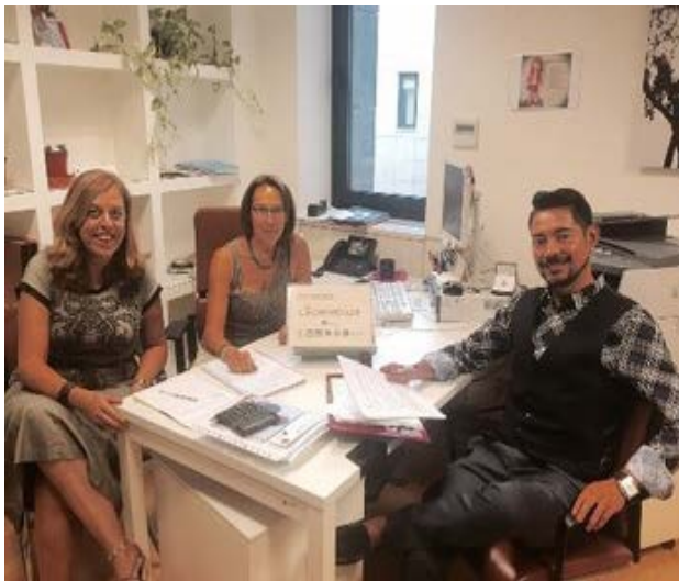
Official meeting with the Public body: GENERAL DIRECTORATE OF SOCIAL SERVICES AND SOCIAL INTEGRATION OF THE REGIONAL GOVERNMENT OF MADRID AND EUROPEAN PROJECTS AREA. (Dirección General de Servicios Sociales e integración de la Comunidad de Madrid y Área de Proyectos Europeos)